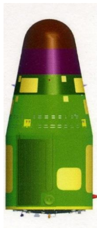
FIG. 3. The recoverable satellite SJ-10, totally 5.144 m in height, and the top part and lower part are respectively the recoverable capsule and un-recoverable capsule.

The recoverable satellite is a very useful spacecraft for microgravity experiments [6], and the satellite of SJ-10 is the 25 th recoverable satellite of China. The structure of SJ-10 satellite is shown in FIG. 3.