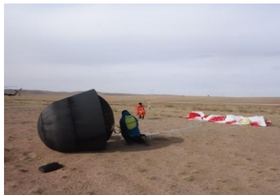
FIG. 4. Landing of the recoverable capsule.

Recovery capsule landed at 16:30 on April 18 (FIG. 4). The research group arrived the place where the recoverable capsule landed at 16:45, then checked and disposed recovery capsule. The recovery capsule landed at a good state without deformation. The capsule was intact, the ablation structure was normal, and the capsule surface showed compact and black without flake. After disposed at landing place, the capsule was transported to the field where recovery group brought out payloads and scientific samples by helicopter. Recovery group completed the removal of 19 scientific devices and handed over them to scientists and customers.