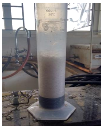
FIG. 1. Foam height.