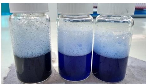
FIG. 2. Dirt dispersion test.

Dirt dispersion: The dirt dispersion ability increased as the concentration of the charcoal increased in the shampoo. It is shown in FIG. 2.