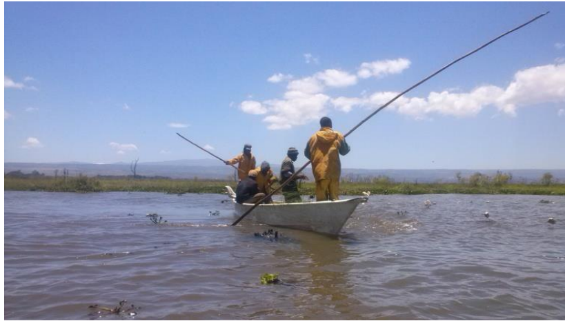
FIG. 2. Illegal fishers using gillnets in demarcated breeding areas in lake Naivasha. (Commonly known as Korosho).

The use of illegal fishing methods continues to escalate in Lake Naivasha. It is unfortunate that these illegal fishing practices are having a significant impact on the lake's ecosystem due to destruction of the fringe macrophytes, critical refugia for fish. IUU fishing in Lake Naivasha is driven by a number of co-related social and economic factors.