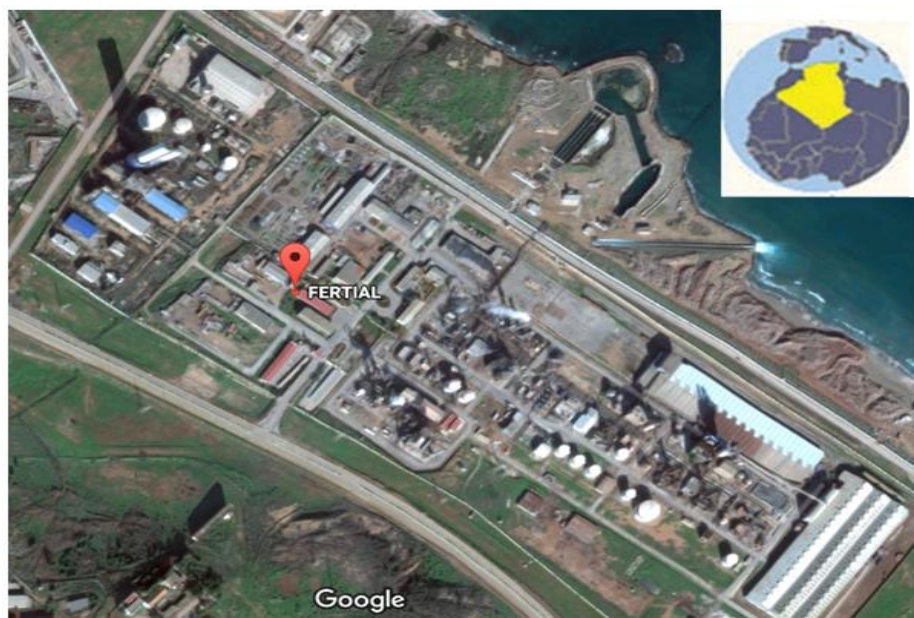
FIG. 1. Location of the fertilizer complex (Fertial) in the site of Arzew.

The qualitative and quantitative assessment of the degree of pollution of the effluents produced by this complex extends over the period from October 2013 to April 2014 [6]. The assessment procedure is based on the assessment of gaseous releases. TABLE 1 summarizes the sampling and analysis techniques used in this study.