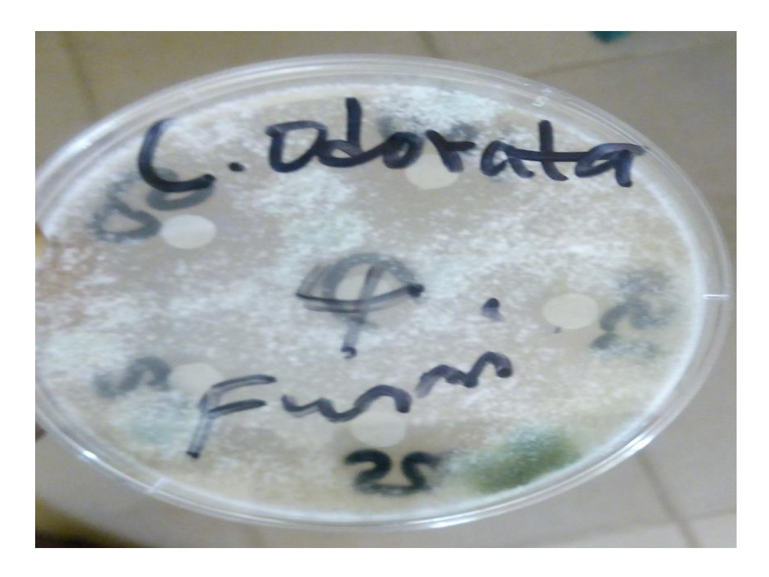
FIG. 2. The effect of ethanolic plant extract of C. odorata on in vitro inhibition of mycelial growth of Streptomyces spp. at different concentrations.