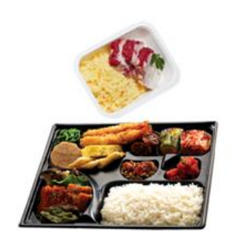
(a) Ready to eat food

The subjects of this study were Koreans in their teens to 70's or older, and a survey was conducted regardless of the region. From November 13, 2021, 600 people were surveyed over four days, and 544 responses were received. Among them, 538 responses were statistically processed as the final survey data, excluding six whose survey data lacked credibility because of double and erroneous responses [9-11]. The contents of the survey consisted of four areas: individual characteristics of the subjects, understanding and knowledge of HMR, preference for HMR, and future thoughts and direction of HMR (Figure 1).