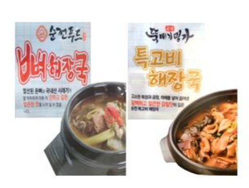
b) Ready to heat food