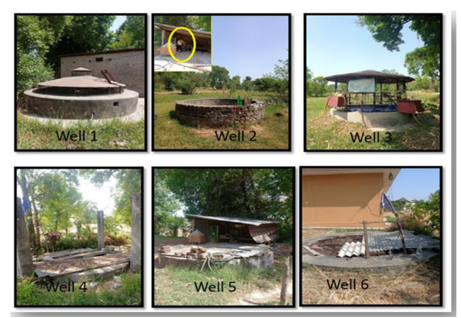
FIG. 2. Pictures of observed wells collected by investigator during field survey.

Water sampling: A systematic random sampling method has been used that directly influences the validity of the investigation findings. In present investigation, total eighteen water samples (six samples per month) were collected from six different sampling points (wells) in selected area and analysed for 11 physiochemical water quality parameters (pH, turbidity, TDS, conductivity, Cl<sup>-</sup>, NO<sub>3</sub><sup>-</sup>, Ca, Mg, DO, phosphate and fluoride) for period of three month (April-June), 2022 (Figure 2). The water samples have been collected from wells varying in depth from 100 m-300 m and the method followed for the analyses of wells water quality parameters shown in Tables 1 and 2. In the present investigation, standard methods for the examination of groundwater, 21^{st} edition published by American Public Health Association (APHA) was used for determining parameters. To get a comprehensive picture of overall quality of wells water in selected study area, the Water Quality Index (WQI) has been calculated for the 11 parameters (pH, turbidity, TDS, conductivity, Cl<sup>-</sup>, NO<sub>3</sub><sup>-</sup>, Ca, Mg, DO, phosphate and fluoride) (Table 1) [5].