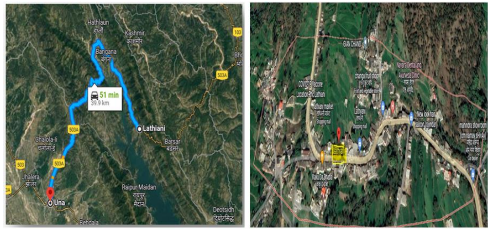
FIG. 1. Map of study area

77.78% females are literate. The climate of study area is tropical to temperate in nature, as the terrain varies from plains to high hills. Temperature varies from minimum of 4^{\circ} C in winter to maximum of 46^{\circ} C in summer. The annual average rainfall in the area is around 1040 mm, with about 55 average rainy days [4].