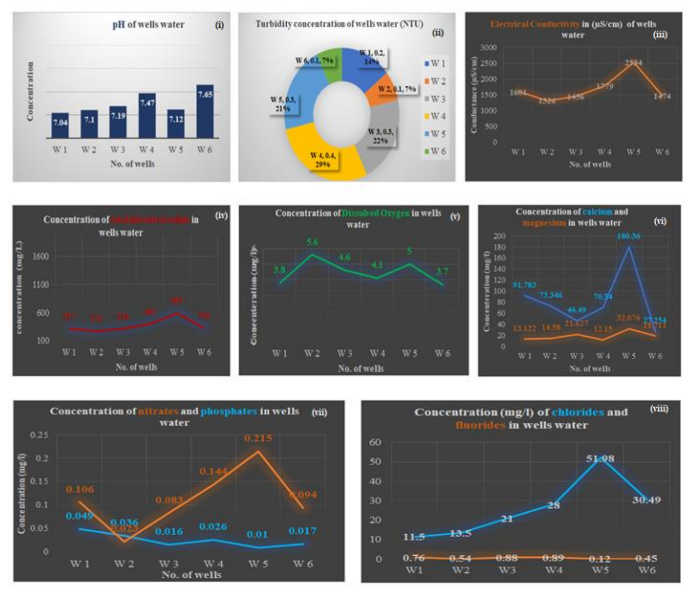
FIG. 3. Diagrammatic representation showing observed concentration of parameters in wells water samples.

conductivity, total dissolved solids, dissolved oxygen, calcium, magnesium, nitrates, phosphates, chlorides and fluorides were detected all within the permissible range as prescribed for drinking water by the BIS (IS 10500) (2012). In the present investigation, the calculated WQI of wells has been found to be 27.712 which rated under good water quality category (Figure 3).