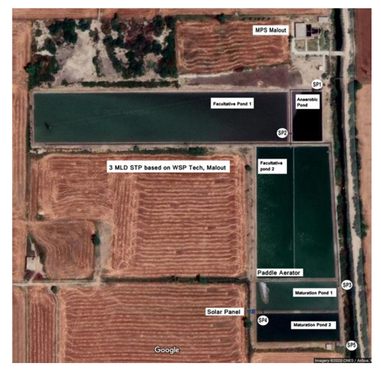
Fig 3- aerial view of WSP based STP, Malot showing components & sampling locations

The following plan shows systematic layout of various components of 3MLD Sewerage treatment plant based on waste stabilization technology also showing the location of aerator in maturation pond and flow pattern of sewerage treatment plant. Also the points of sampling for analyzing various parameters of waste water are shown to establish various relations between STP components and effect of adding aeration with the help of prototype used in this research. The details and plan/aerial view of STP is as follows:-