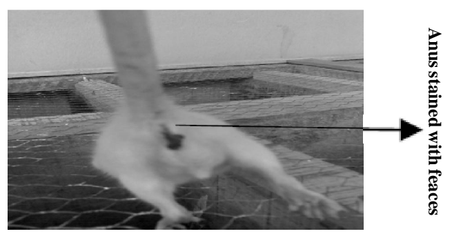
Figure 1: Rats showing symptom of diarrhoea