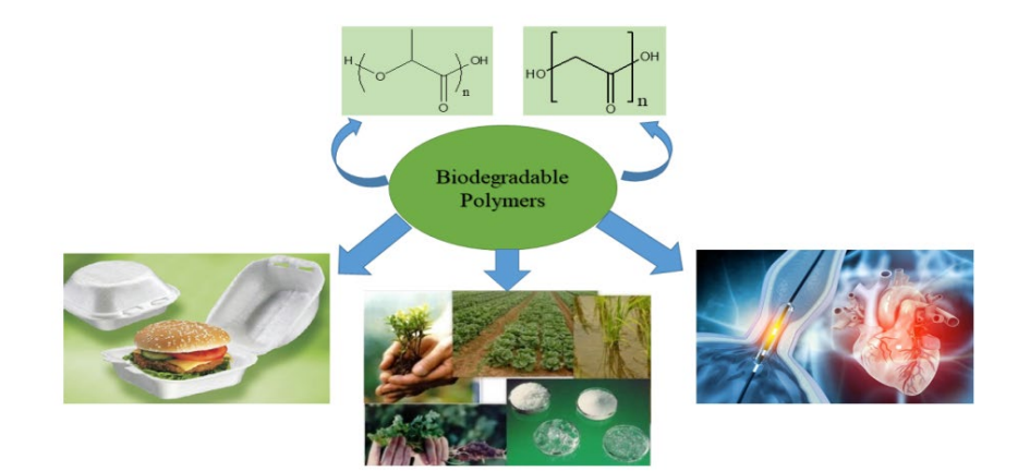
FIG. 1. The formula of the biodegradable synthetic polymers Poly Glycolic Acid (PGA) and Poly Lactic Acid (PLA).

Biodegradation is usually quantified by incubating a chemical compound in presence of a degrader, and measuring some factors like oxygen or production of CO<sub>2</sub>. These molecules form an interatomic type of bonding and is adamant meaning it is tough for microbes to break the bonds and digest them. Thus a long period is required to decompose them [10]. The polymers which can decompose in a few days are decomposed by the action of microorganisms and are known as biodegradable polymers [11, 12]. The biodegradation studies demonstrate that microbial biosensors are a viable alternative means of reporting on potential biotransformation. However, a few chemicals are tested and large data sets for different chemicals need for quantitative structural relationship studies [13].