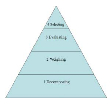
Figure 1: AHP analysis four steps

Apply analytic hierarchy process to solve problems need to establish indicators logic relations, AHP analysis includes four steps, as Figure 1.