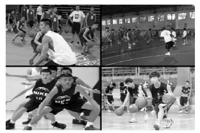
Figure 2 : Athletes' sports events

ing event into dada analysis form, then, \lambda = \{-0.7788, 0.9196, 1.6669, 2.3331, 3.0804, 4.7788\},\