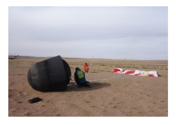
FIG. 4. Landing of the recoverable capsule.

Recovery capsule landed at 16:30 on April 18 (FIG. 4). The research group arrived the place where the recoverable capsule landed at 16:45, then checked and disposed recovery capsule. The recovery capsule landed at a good state without deformation. The capsule was intact, the ablation structure was normal, and the capsule surface showed compact and black without flake. After disposed at landing place, the capsule was transported to the field where recovery group brought out payloads and scientific samples by helicopter. Recovery group completed the removal of 19 scientific devices and handed over them to scientists and customers.