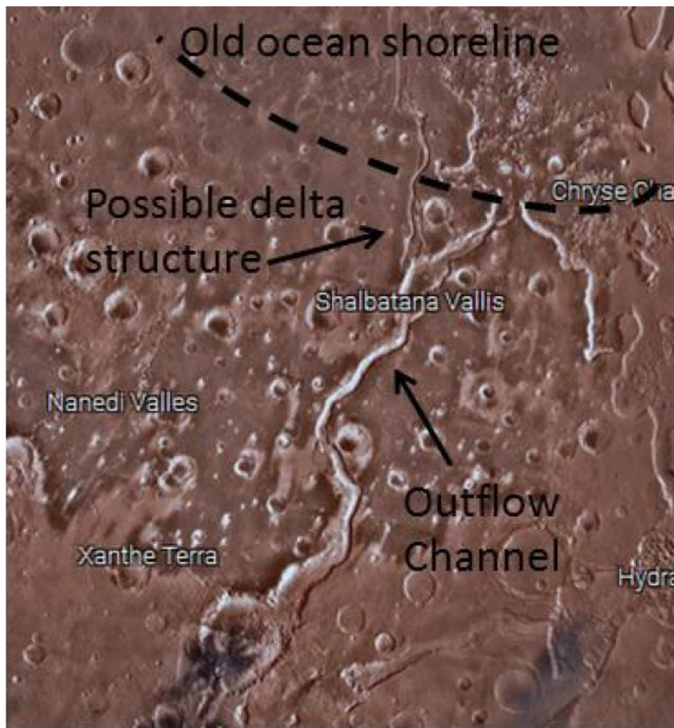
Figure 3 : A possible delta structure on the old ocean shoreline found in the chryse region

The presence of a liquid ocean and hydro-cycle is thus consistent with planetary greenhouse of Carbon dioxide at approximately one atmosphere with perhaps additional gases such as methane. Such a dense atmosphere of carbon dioxide, in the presence of abundant liquid water, could have been reduced by formation of carbonates through weathering [26] , however an acidic ocean would have prevented carbonate formation. Mars soil analysis from the landers is consistent with such an acidic ocean [27] .