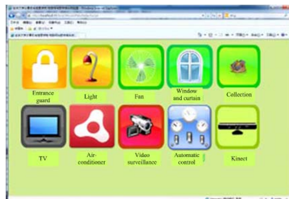
Figure 2 : Control pages of smart office system

In order to realize intelligent control, firstly gesture recognition and voice recognition instructions of various household articles should be defined individually. Kinect icons are listed in the homepage of smart home system, shown in Figure 2.