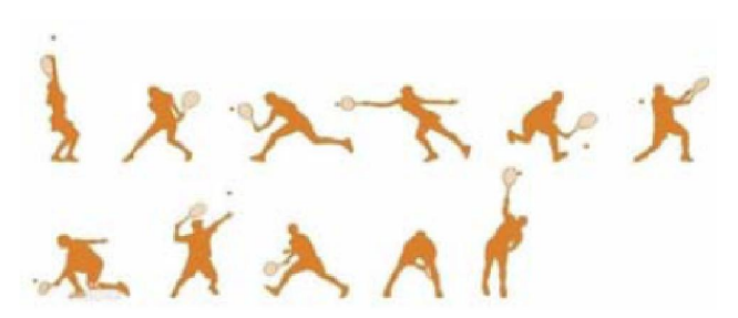
Figure 1: Tennis basic motion

Tennis has been rapidly developed since modern times, many national people are infatuated with it, and tennis basic motion is as Figure 1 show.