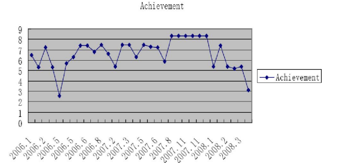
Figure 2: Performance trend chart