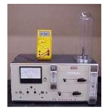
Figure 1 : Limiting oxygen index apparatus

Gel permeation chromatography of unsaturated polyester resin is shown in figure 3. Gel permeation chromatography of polyester resin was done by using Perkin Elmer 200 GPC instrument. PL GEL mixed B type of column, Tetrahydrofuran as solvent and refractive index detector was used in this analysis. Volume of