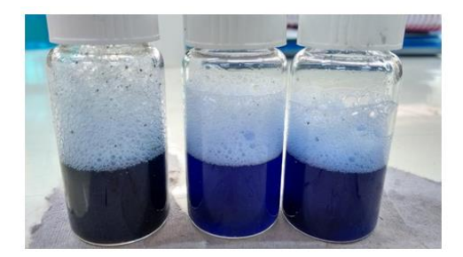
FIG. 2. Dirt dispersion test.

Dirt dispersion: The dirt dispersion ability increased as the concentration of the charcoal increased in the shampoo. It is shown in FIG. 2.