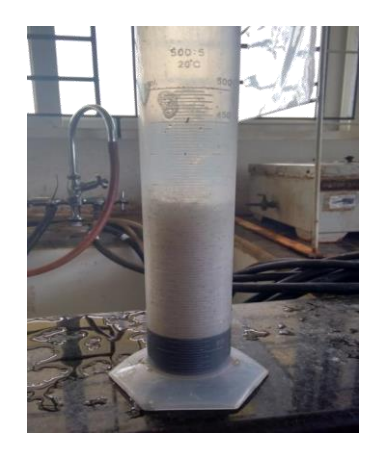
FIG. 1. Foam height.