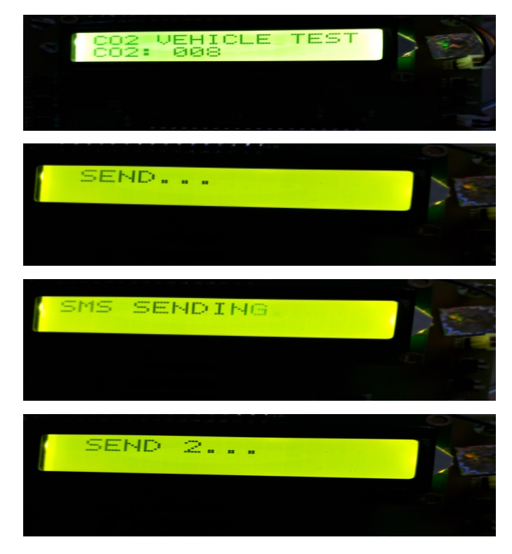
Fig. 4: Display output