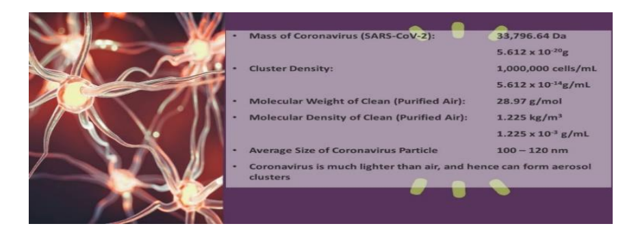
FIG. 2. Cell cluster volume mass computation.

Given the molecular weight of coronavirus as 33,796.64 Dalton and the average size of coronavirus at 100 nm-120 nm, in this work, the total mass of observable laboratory cell cluster density of 1 million cells per mL was compared with the mass/mL of purified air as presented in FIG.2 [12-15]. We concluded that it is not only plausible but also practical for coronavirus to be communicable via aerosol mode. This is further corroborated by the characterization of coronavirus in a "Characteristics of SARS-CoV-2 and COVID-19" by Hu et al. work by where they established that smaller and much more numerous particles known as aerosol can be exhaled by COVID-19 patients, linger in the air for a long time and inhaled by someone else to cause the virus to penetrate deep into the lungs of the new host [16].