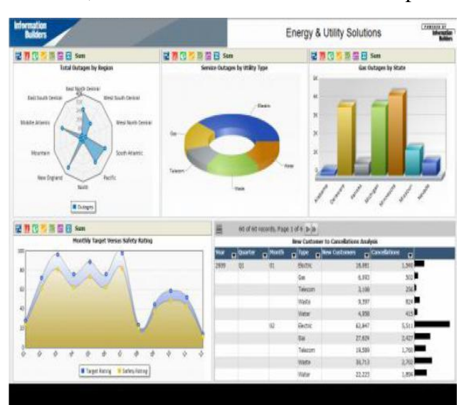
Figure 2: Information builders dashboard

The so-called "performance management dash-boards" usually refers to the dashboards contained the balanced scorecard's KPI, put BPM as the center. Through integration the enterprise application, it solves the barriers among departments; A wider "performance management dashboards" will unite the supply chain enterprise, provide outside dashboards, share data and KPI, make enterprises execute their joint strategies more effectively. According to extranet dashboards, Gartner has pointed out that between enterprises, successful collaborations "must involve the joint definition of metrics, which reinforces win-win relationships" [12].