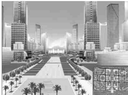
Figure 3 : Dimensional navigation

During the buildings, structures and other virtual scene modeling process, the advised software is CAD, 3D max, GIS software and virtual reality modeling language and so on, which are for the production of three-dimensional entities. In addition to the three-dimensional entity, it also contains three-dimensional information of these objects, such as the light direction, light source characteristics,, materials texture, gloss, transparency, and the scene information.