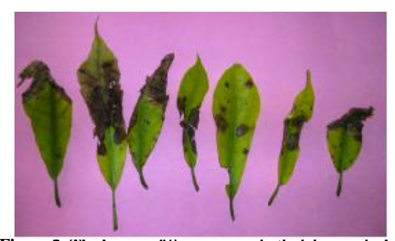
Figure 2: The leaves of Semecarpus kathalekanensis showing the varied degree of infection (Photographs taken from the nursery)