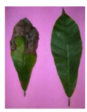
Figure 1: The infected and healthy leaves of Semecarpus kathalekanensis (Photographs taken from the nursery)