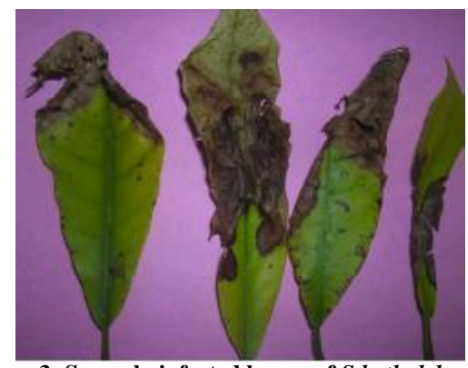
Figure 3: Severely infected leaves of S.kathalekanensis (Photographs taken from the nursery)

nicity test by using the spore suspension of C.geniculata . The spore concentration was prepared with 50,000 conidia/ml. The spore concentration was adjusted in haemocytometer by using sterile distilled water. The prepared spore suspension was sprayed on to the leaves of S.kathelekinesis (two year old) to reconfirm the symptoms. The symptoms were observed regularly.