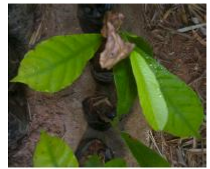
Figure 6: Plants of Semecarpus kathalekanensis showing the symptoms in the nursery after spraying

The leaf looks like burned on that mycelium of the fungi is with conidia is observed. Moisture and cold condition also favors the sporulation and spread of the disease. The conidia may spread through the wind, water or contact of the leaf.