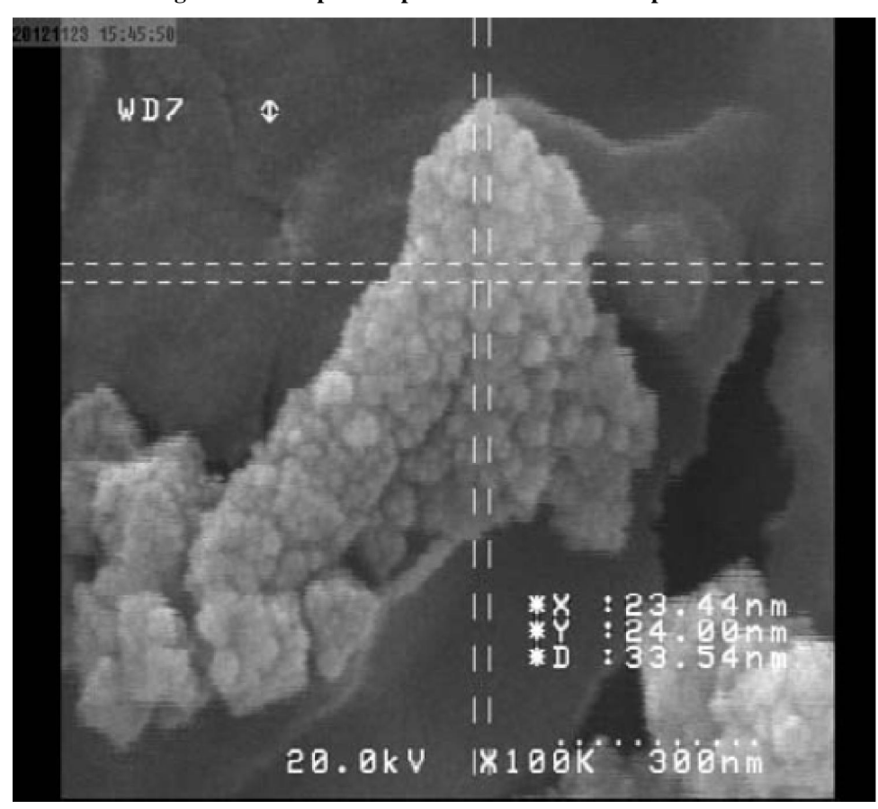
Figure 1b: SEM photo of produced zinc oxide nano particles