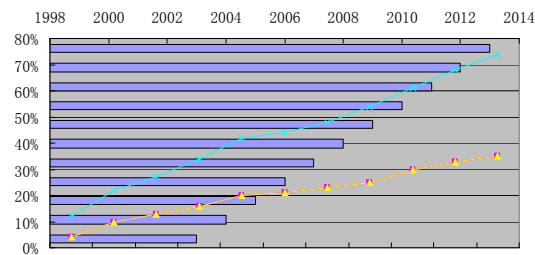
Figure 1 : How sustainable development outlook enhances economic efficiency

In China, sustainable development outlook is more and more popular in recent years. It enhances economic and social benefits of tourism.