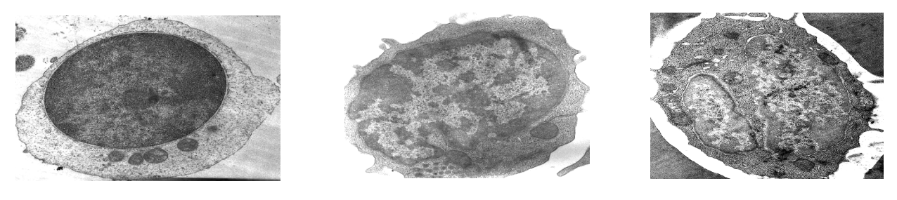
ControlLightGraveFigure 2 : Ultrastructure of lymphocytes in vivo of controls, of light and grave severity asthma patients.

The method of electronic microscopy by transmission make it possible to identify the morphological differences in lymphocytes of healthy people (control) and asthmatic patients in vivo for the majority of the parameters. As shown in figure 2, the lymphocytes of relatively healthy donors had a normal shape. The cellular membrane was well drawn. The nucleus generally occupies a large portion of the cell: in the nucleus there are nucleolus, the peripheral chromatin, and clear karyoplasms (figure 2). The ultra structure of lymphocytes of the patients differs from those of healthy ones by voluminous nucleus, and a segregation of the nucleolus. Lymphocytes with intussusceptions at membrane surface and formation of blebbing were observed on the cellular