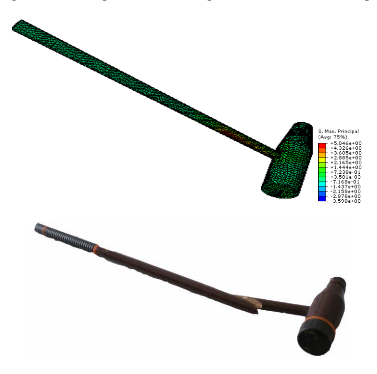
Figure 2 : The maximal stress distribution of mallet (top) and fracture mallet in real performing event (bottom).

As shown in Figure 2, the maximal stress was concentrated in the proximal of the bottle, which was in good accordance with the mallet fracture happened in real performing event. It is very important to add some special design or material process for strength reinforcement on the proximal of the bottle.