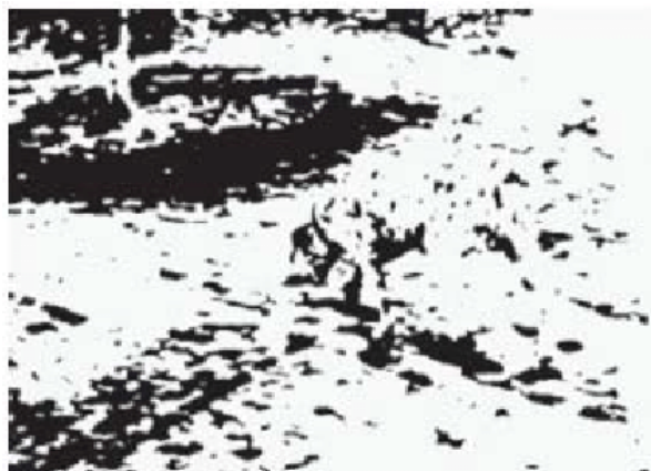
FIG. 1. The classic dalmatian dog photograph (by R. C. James) is initially difficult to see because interpolation is mostly absent, and the shape must be cognitively inferred (or “abstracted”) from a few local elements (Keane 2018).

Thus, it will be quite helpful if by means of some HEPs, pattern processing capabilities (qualitative facet) and information processing capacity (quantitative facet) of HOs and researchers could be improved [16-19]. Hence, there is a generic implication for HEPs in all disciplines of sciences including the physics ( FIG. 1 ).