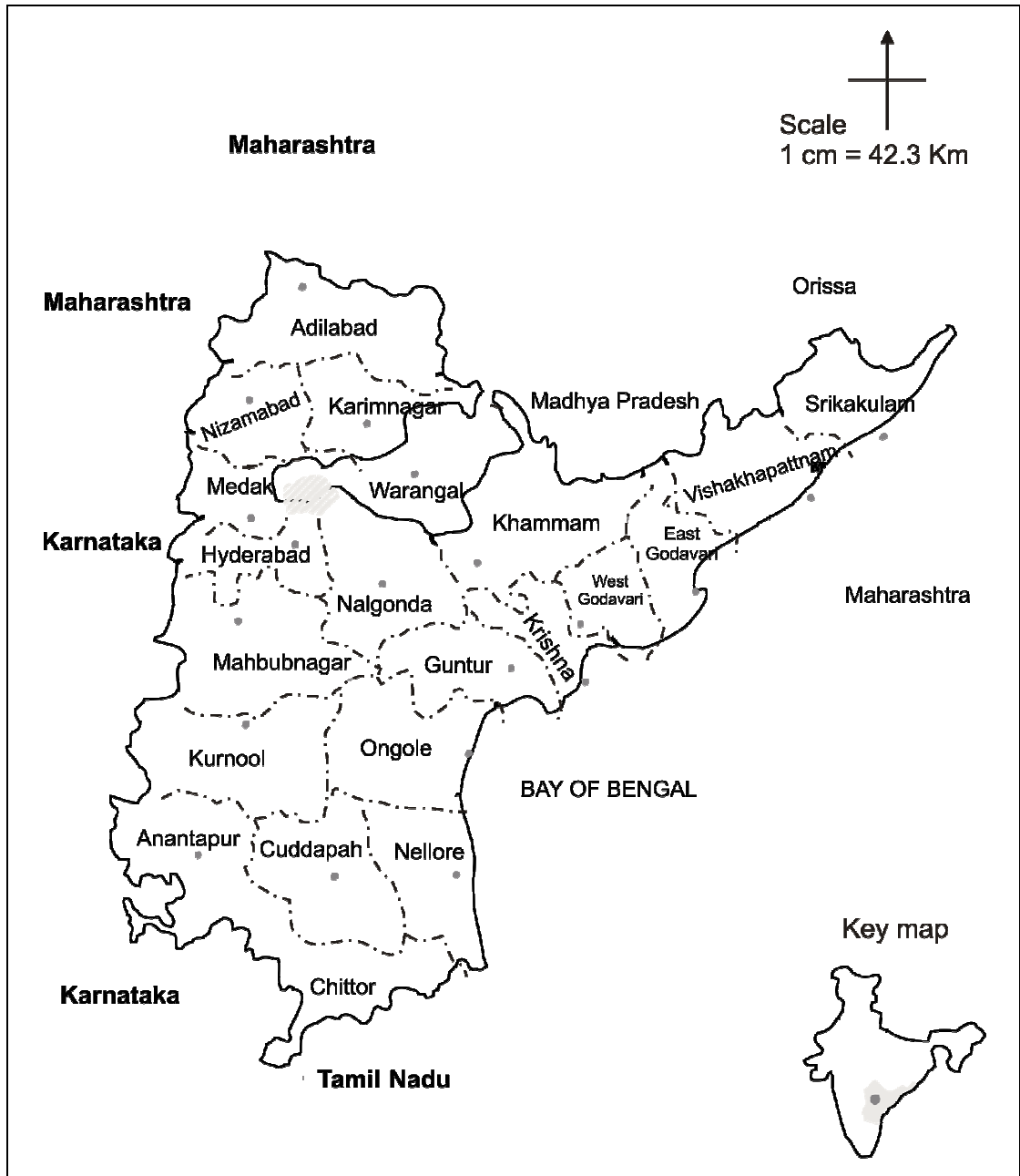
Fig. 1: Location map of Gajwel taluk, Medak Dist. A. P.

confined to river and stream courses. The drainage pattern is of dendritic type.