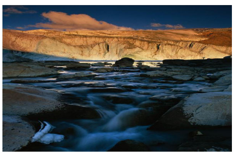
Figure 1: The ice cap of quelcaya in peru (Adkins, 1983)[25]

approximately 12 percent of the rise in sea levels<sup>[22]</sup>. It is revealed by the National Snow and Ice Data Center (NSDIC) that North Pole ice is continuing to melt at a dangerous rate. The Arctic Summer ice may disappear over the next few years, much earlier than scientists had previously predicted<sup>[23]</sup>. The data about the extent of Arctic ice caps indicates that there is a decline to the lowest rate in September 2012. The lowest extent drops to 1.32 x 106 mils<sup>2[23]</sup>. The Arctic ice caps declined at the rate of 13% each decade since 1979. It was observed that the lowest ice extent had been seen for the 33 years from summer of 2012 year. The mean reason for the notable change is the global warming due to climate change. Continues emission of green house gases increases the earth temperature. The united nation has a call for the industrial counties to, at least, decrease the emission. As shown in TABLE 1, if the declining rate of September Arctic sea ice continues at the current rate this may lead a great danger for the ice cap melting. Accordingly, the sea level will increase and will cover certain coast cities, villages and islands all over the world.