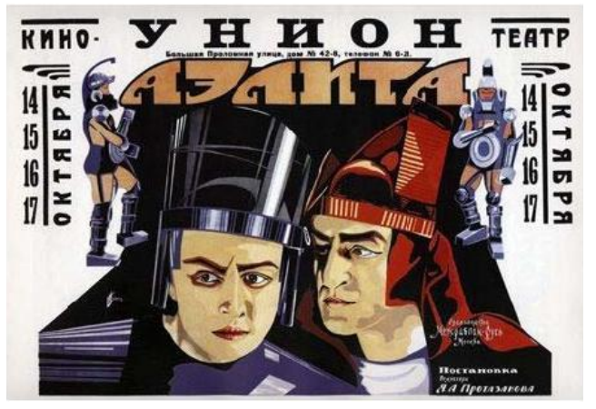
Poster for the silent film

A notable step in the field of safety was the creation in 1970, the national organization - the National Committee of the USSR on the safety of aircraft and spacecraft, which coordinated the work of all concerned departments of the country. The main objectives of the aircraft and spacecraft were: implementation of relations with international and national foreign organizations, academic institutions and companies directly involved in solving actual problems of safety of aircraft and manned spacecraft. At first, the activity of spacecraft was expressed in a rigorous selection of future cosmonauts on health and psychomotor reactions, in search of such methods cosmonaut training that would enable them to fend off