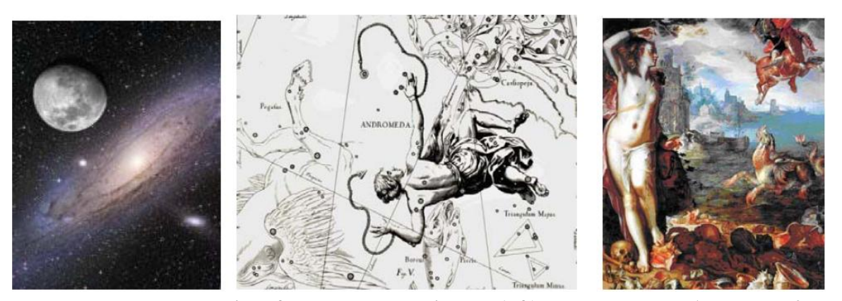
Andromeda galaxy - the constellation of the northern hemisphere (left). In the three-star Andromeda 2nd magnitude and spiral galaxy visible to the naked eye already known from the X century (in the center of the star chart with the Atlas 1690). According to Greek mythology, Andromeda was the daughter of the Ethiopian king Cepheus and Queen Cassiopeia. Was given to the father as a sacrifice to the sea monster, ravage the country, but is rescued by Perseus (right). After the death turned into a constellation.

the most likely contingencies and to survive in a possible emergency landing as on land and on the water. Improving the space-rocket systems and ground support equipment, complexity of space activities has led to the fact that under the aircraft and spacecraft, along with sections of the aviation segment was created and space section headed by Georgy Beregovoi.