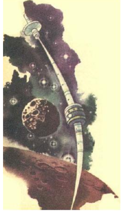
Modern design of space elevator