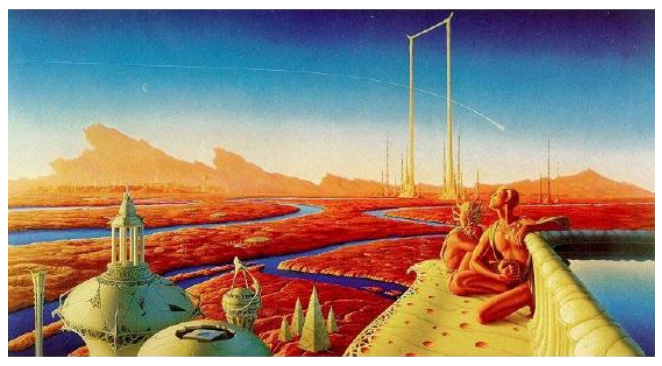
"Elita" ray bredberi "The Martian Chronicles"