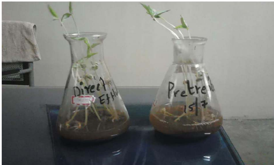
Figure 1: Moong plants having both crude and pretreated effluents in two different flasks

The plant moong was grown for 3 days in flask with soil. The sprouts turned into with small plantlets. There were two plantlets taken in the flasks. One flask was supplied with 50ml of untreated and the other with the pretreated sample of effluent. The nitrate level was observed for 1 day, 2 days and the 3days.