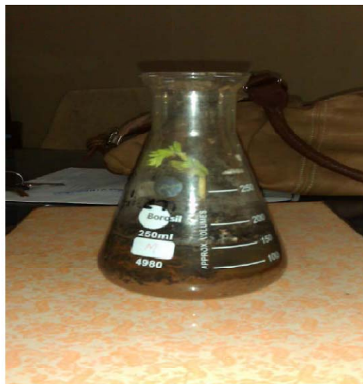
Figure 2: Tamarind plant having crude effluent in conical flask

The tamarind plant was grown at flask level for 10 days. Both treated and untreated of 50ml were added to each flask and nitrates were estimated on the day 1, day 2 and the day 3.