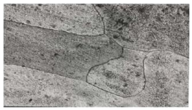
Figure 2 : Micrograph of Zn-Al + 2%SiC After Corrosion test

Figure 1 : gives the corrosion rate of composites with different percentage of SiC composites reinforced with SiC particulates