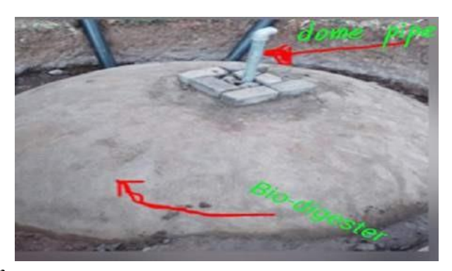
FIG. 3. A 10 m<sup>3</sup> fixed dome bio-digester at AGRC, birbirsa (after construction, 2022)

Main gas pipe and turret: Gas produced in digester and stored in the dome (gas holder) is conveyed to the pipeline through a main gas valve placed exactly at the center point of the dome ( FIG.4.A. ). This main gas pipe is protected with a masonry block called 'turret' constructed to encircle the pipe. A 30 cm - 45 cm long GI pipe with diameter ranging from 25 mm to 35 mm is used as main gas pipe. Turret is constructed to protect high risk of damage from human or animal activities ( FIG.4.B. ).