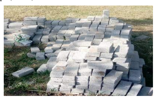
FIG. 1. Bricks made by biogas mason themselves

Bricks: They must be well baked and regular in shape. Before use, bricks must be soaked for few minutes in clean water. This will prevent the bricks from soaking moisture from the mortar after laid in place. In our case, we used locally made bricks which are baked, white in colour and regular in shape ( FIG.1 )..