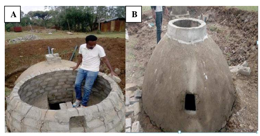
FIG. 6. A.B. Images of outlet at AGRC, Birbirsa

Slurry Pit ( Composing Pit ): The slurry coming out of the outlet displacement chamber discharges into the slurry pit which is also known as composting pit ( FIG.7.A, 7.B. ). The size of such composting pit should at least be equal to the volume of the biogas digester. However, in our case the size of compost pit is 1.5m depth and 1m width. This is due to lack budget assigned.