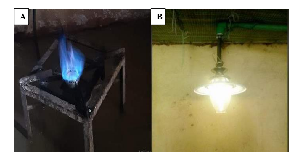
FIG. 8.A.B. Images of biogas stove and lamp installed at AGRC, Birbirsa (A) Biogas stove (B) Lamp installed

Gas lamp ( FIG.8.B ) with shape similar to the kerosene lamp was used in the area. Due to access of electricity is there in the area, the use of biogas lams was limited during the time of power-cut.