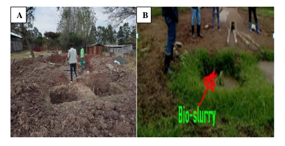
FIG.7.A.B. Images of composing pit at AGRC, Birbirsa

Slurry Pit ( Composing Pit ): The slurry coming out of the outlet displacement chamber discharges into the slurry pit which is also known as composting pit ( FIG.7.A, 7.B. ). The size of such composting pit should at least be equal to the volume of the biogas digester. However, in our case the size of compost pit is 1.5m depth and 1m width. This is due to lack budget assigned.