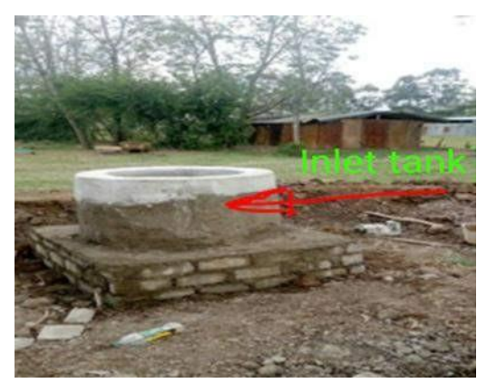
FIG. 5. Images of inlet tank at AGRC, Birbirsa

Outlet (Displacement chamber) construction: The outlet system consists of an outlet opening known as manhole , a tank called outlet displacement chamber and outlet opening of suitable dimension at proper height in the outlet wall. The manhole is provided at a point diametrically opposite to the inlet pipe to avoid short-circuiting of feeding. This opening serves a number of purposes: as a manhole or gate for entry and exit of people during plant construction and maintenance. The overflow opening discharges slurry at the ground level in some of the plants, which increases risk of entering the floodwater into the digester through overflow tank.