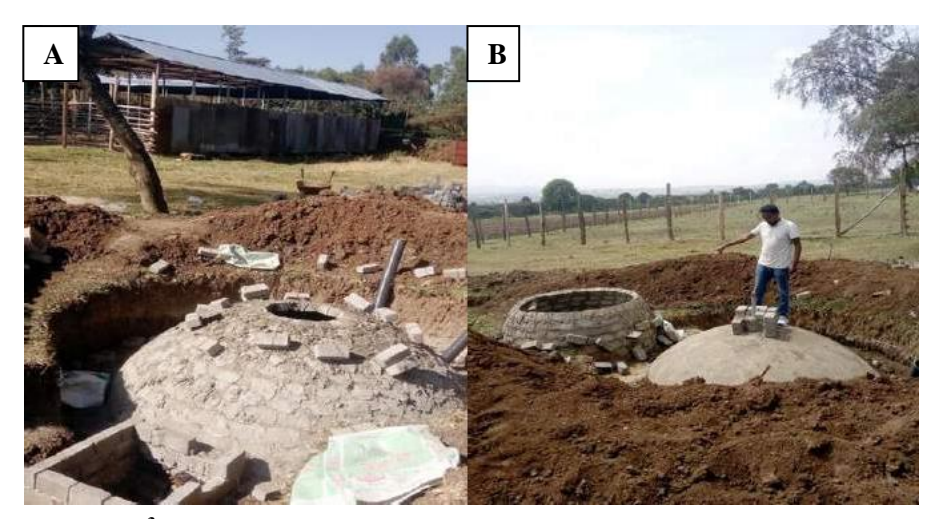
FIG. 2.A.B. A 10 m<sup>3</sup> fixed dome bio-digester abebech gobena research center (AGRC), Birbirsa