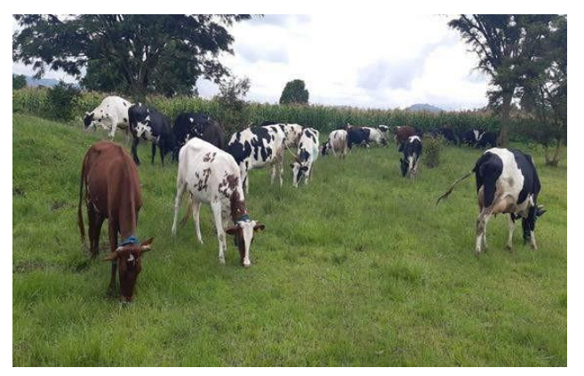
FIG. 9. Image of beef cattle production, source of feedstock

The amount of gas production in biogas digester depends upon the quantity of feeding added to it daily provided the plant is technically all right. The daily feeding we have been applying is 160 kg of cow dung and 160 liters of water with equal ration since the constructed biogas plant size is 10m<sup>3</sup>. ( FIG.9. ).