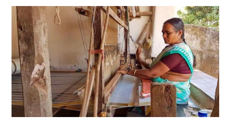
Figure 2: A weaver in rural India making a handloom fabric.

It is based on the local economy as weavers form an essential part of the rural economy, with specialized handicrafts from different regions. This local production of such fabrics reduces the carbon, water and waste footprint due to travelling and packaging and thus is a practical way of ensuring sustainability after the production stage.