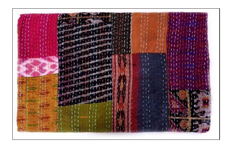
Figure 3: A patchwork rug from Kutch, Gujarat.

compared to a stitched garment. This has been shown vividly by Bairagi in the paper 'Recycling of Textiles in India' [2].