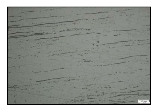
Fig. 4: Micro structure of base metal

The properly solution annealed austenitic structure as per ASTM A 262 is observed in the base metal. Fig. 4 shows the microstructure of the base material.