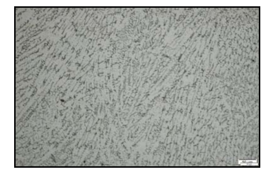
Fig. 5: Micro structure of weld area

Heat affected Zone (HAZ) defined as a part base metal closed to weld fusion zone is metallurgical property affected due to heat of welding. HAZ micro structure with Inter dendritic structure with delta ferrite pool observed in the HAZ so the width of the HAZ is observed as 2-3 mm from weld fusion line. Fig. 6 shows microstructure of HAZ