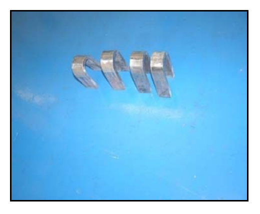
Fig. 2: Bend test specimens

Four number of root & face bend specimen are bent around 180^{\circ} with mandrel diameter of 24 mm (4T) as per ASME section IX and carried out LPE. There was no evidence of defects were found and the same has acceptable. Fig. 2 shows the bent test specimen.