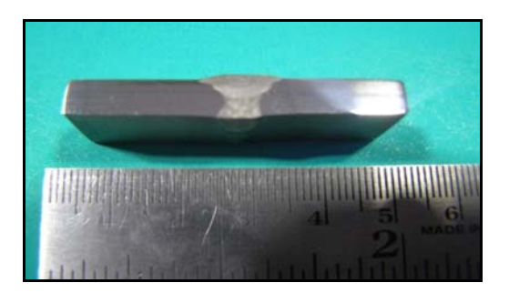
Fig. 3: Cross sectional view of weld specimen for micro structure

To determine the strength, the Hardness measurements were performed. The hardness profile was carried out were the different main areas of interest were identified such as base metal, fusion zone (FZ), HAZ. Hardness values are observed along the weld interface (weld, HAZ, & BM) are meeting the specification requirement of 92 HRB (maximum) & found acceptable.