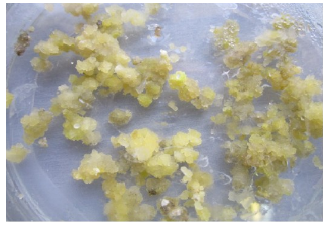
Figure 2 : Callus tissue of Apium graveolens

(Figure 3). In the IR spectrum, peaks at 2850 and 2910 cm<sup>-1</sup> is consistent with –CH2 groups. On the other hand, the peaks at 57, 71,85,99, 127 and 141m/z are related to fragments of a cycloalkane derivative. Ion molecule of 141m/z indicate that the compound has structurally 10 atom carbone. The structure of this isolated compound was confirmed with comparison of its spectral data with dose of literature<sup>[5].</sup>