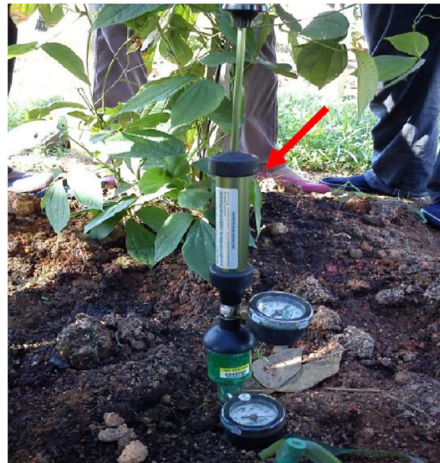
Figure 4 : Vacuum (as indicated) the bubble to avoid air lock in Centibars (or kPa) of soil water tension. Irrometer soil moisture measurement is based on the tensiometric method, because of the fact that the amount of water is not as important as how difficult it is for the plant to extract it from the soil. Soil water tension (or metric potential) has to be overcome for the plant to move water in to its root system.