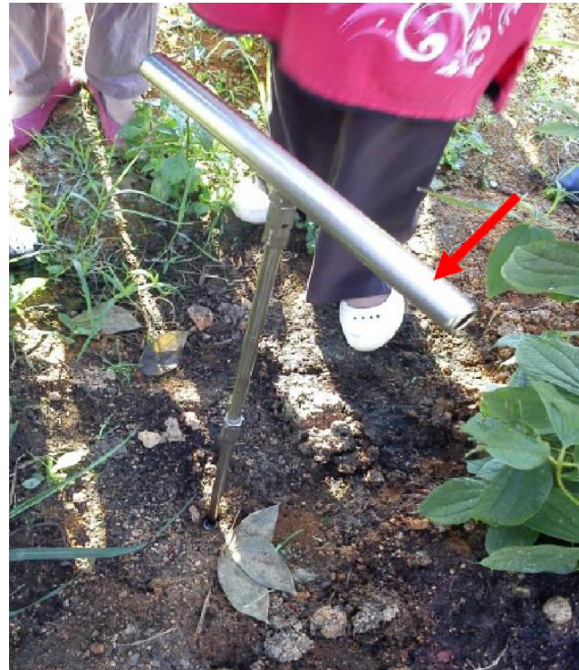
Figure 3 : Make a hole to insert irrometer using specific puncher (as indicated)