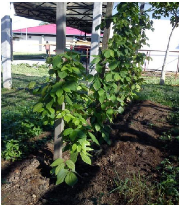
Figure 2 : The location of measure of moisture at kusza farm

Tensiometer is the only one that has direct measurement, which means it actually reads the physical forces at work in the soil while watermark sensor is indirect method of measurement soil water tension. Irrometer soil moisture measurement is equipment that is used to optimize irrigation and maximize conservation especially in agriculture sector. Tensiometric measurement is the physical force actually holding water in the soil, measured