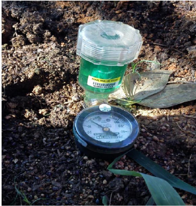
Figure 5 : Then left and take reading of soil moisture for every 10 minutes.

Moreover, based on the reading recorded as in figure 6, the soil is stated as clay which it is in the range of field capacity. Field capacity means that the gravity has pulled all the water from the largest pores. The smallest pores hold the water against gravity, while the larger pores are filled with air. This is the optimal condition for crop development which is the water is held at a force that is easily overcome by the uptake power of the roots, whereas at the same time the soil is sufficiently ventilated