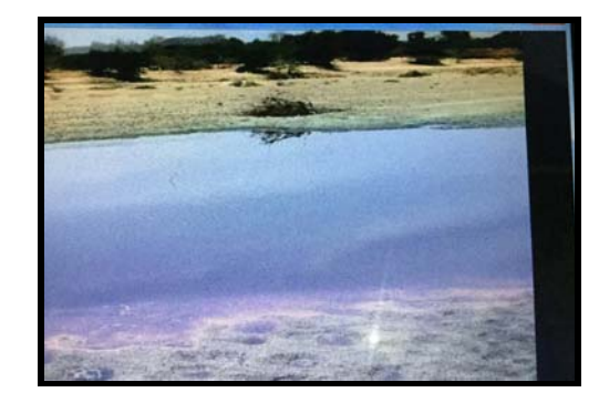
Fig. 3: Coloured effluent in Luni river, Balotara