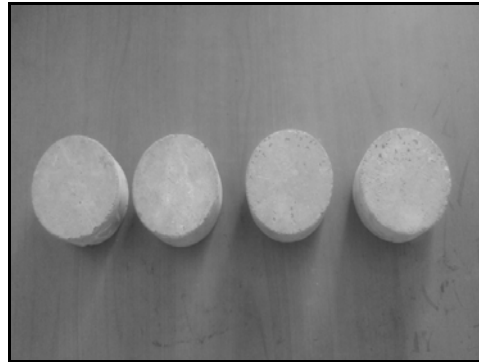
Fig. 4: RCPT test assembly