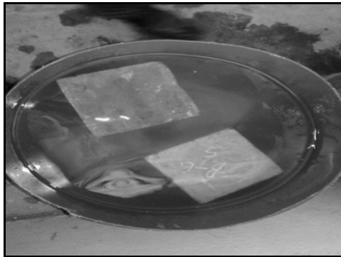
Fig. 3: Acid resistance test