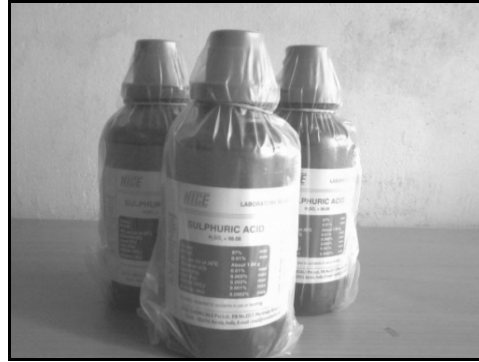
Fig. 2: Sulphuric acid