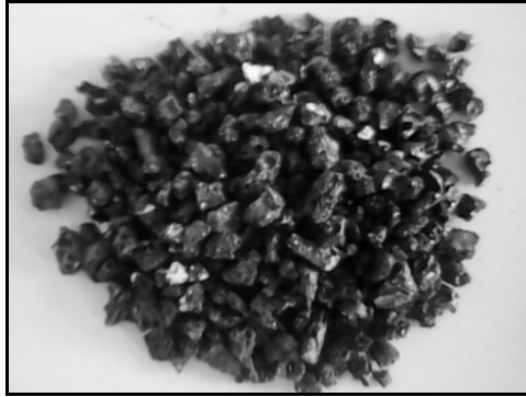
Fig. 1: Steel slag aggregates