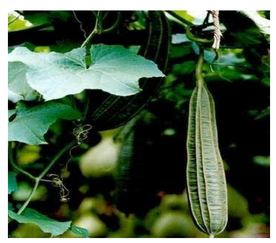
Figure 1 : Leaves of Luffa acutangula