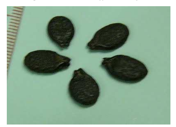
Figure 3 : Seeds of Luffa acutangula