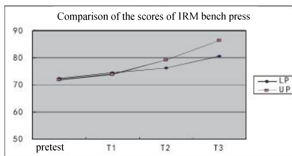
Figure 1 : Comparison of the scores of 1RM bench press after the interventions of LP and UP

After three months' power intervention, shown as Figure 2, when testing the test results of bench press of LP and UP group, it can see that there is no significant difference and it is less than 0.05, which indicates a significant difference does not exist. However, in the test phase within the group, the intervention of the two groups was significantly less than 0.05, indicating that there are significant differences. It can be seen very clearly from Figure 2 that UP group is much higher than the LP group on the increasing rate of the power. The increasing rate from T1 to T3 in the LP group is 9%, while the increasing rate of the UP group is 17% at the same phase. By comparing the increasing rate of the three stage of two groups after intervention, it can be known that: in the stages of pretest and T1, the two intervention groups have the same scores increasing rate which both are 2.1kg, but in the stages of T1 and T2, the increasing rate of LP group is 67.9% of the UP group, after entering the stage of T2 to T3, the score increase rate of LP decreases obviously, slipping to 40.2% of the UP group and there is very obvious contrast between the two groups. It is more obvious for nonlinear power cycle training to improve the scores of the maximum bench press.