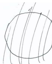
Figure 1 : Student's answer to the question

Before this course was taught to the students,