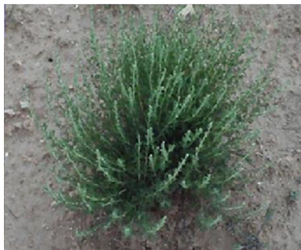
Figure 2 : Stand and plant of sagebrush ( Artemisia herba-alba Asso)