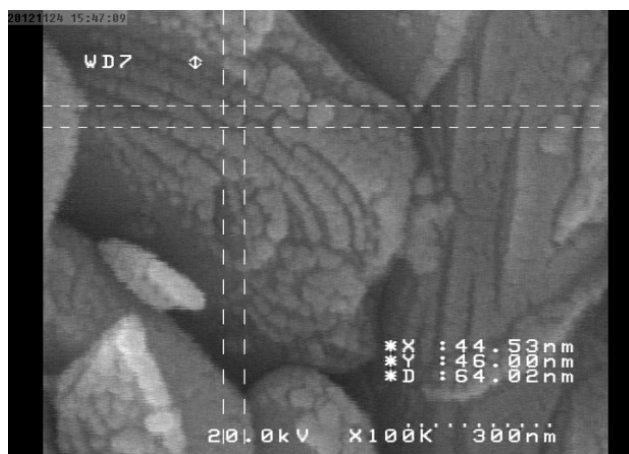
Figure 2 : SEM of nano-particle of Pb_2(SO_4)O produced by calcinations of [Pb(bpy)(NCS)_2]_n