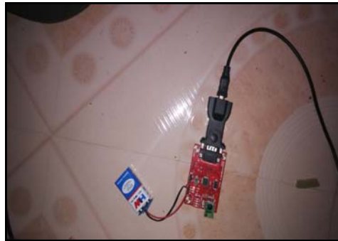
Fig. 3: Transmitter module

In this paper, an efficient method for extraction and digitization of ECG signal from various sources such as thermal ECG printouts, scanned ECG and captured ECG images from devices is proposed. The methodology produced a reasonably accurate waveform that is free from printed character and as tested through heart rate, QRS width and stability calculations. We propose MATLAB software for the Pan and Tompkins QRS detection algorithm for detection of diseases related to heart, implementation every stage processes the entire sample and then can the next stage begin.