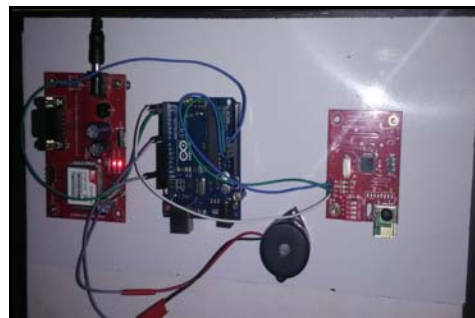
Fig. 3: GSM module

This paper describes the foundation of an efficient tool to generate digital data signals from legated paper charts. The solution proposed is a low-cost software tool that can be particularly helpful to scientists and engineers. In particular, research institutes, laboratories, clinical center's, hospitals and medical offices can largely have benefit of this up-and-coming technique, particularly due to its user friendliness, cost-effectiveness, and accuracy. One still can save data as MATLAB file or as ASCII files and edit or complement the data.