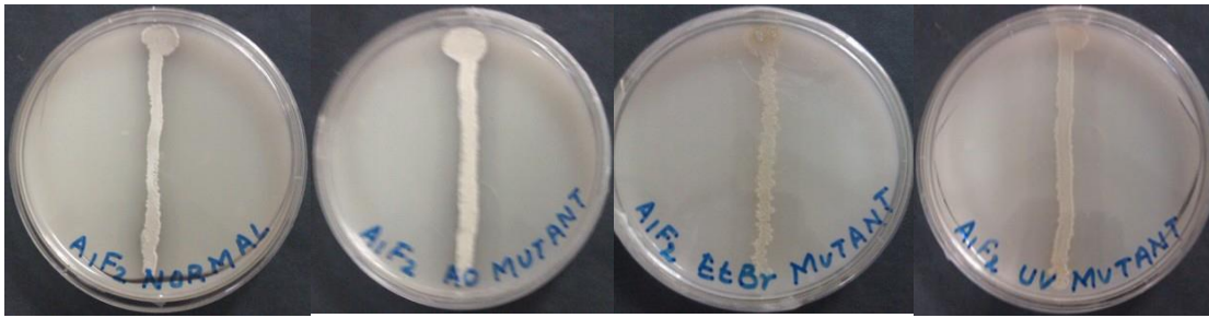
FIG. 3. Casein hydrolysis by parent and mutated isolates.