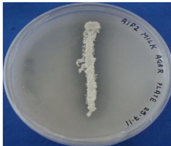
FIG. 1. A1F2 showing hydrolysis on milk Agar media.