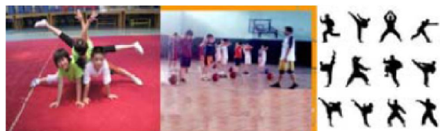
Figure 1: Schematic diagram of part of sports

By recently investigation, it finds that teenagers' physique is declining by year. Therefore, teenagers' physical health problems have attracted people's concern. Physique includes endurance quality, strength quality and flexibility quality. What on earth is the status that sports impact on corresponding qualities has become key points in research, relative hot sports events are as Figure 1.