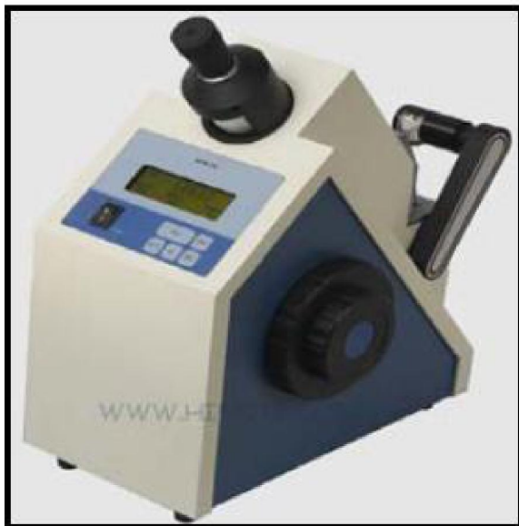
Figure 1: The way - 2s ABBE digital refractometer

The measurement range of the device extends from 1.3000 - 1.7000 with accuracy equals to \pm 0.0002 .