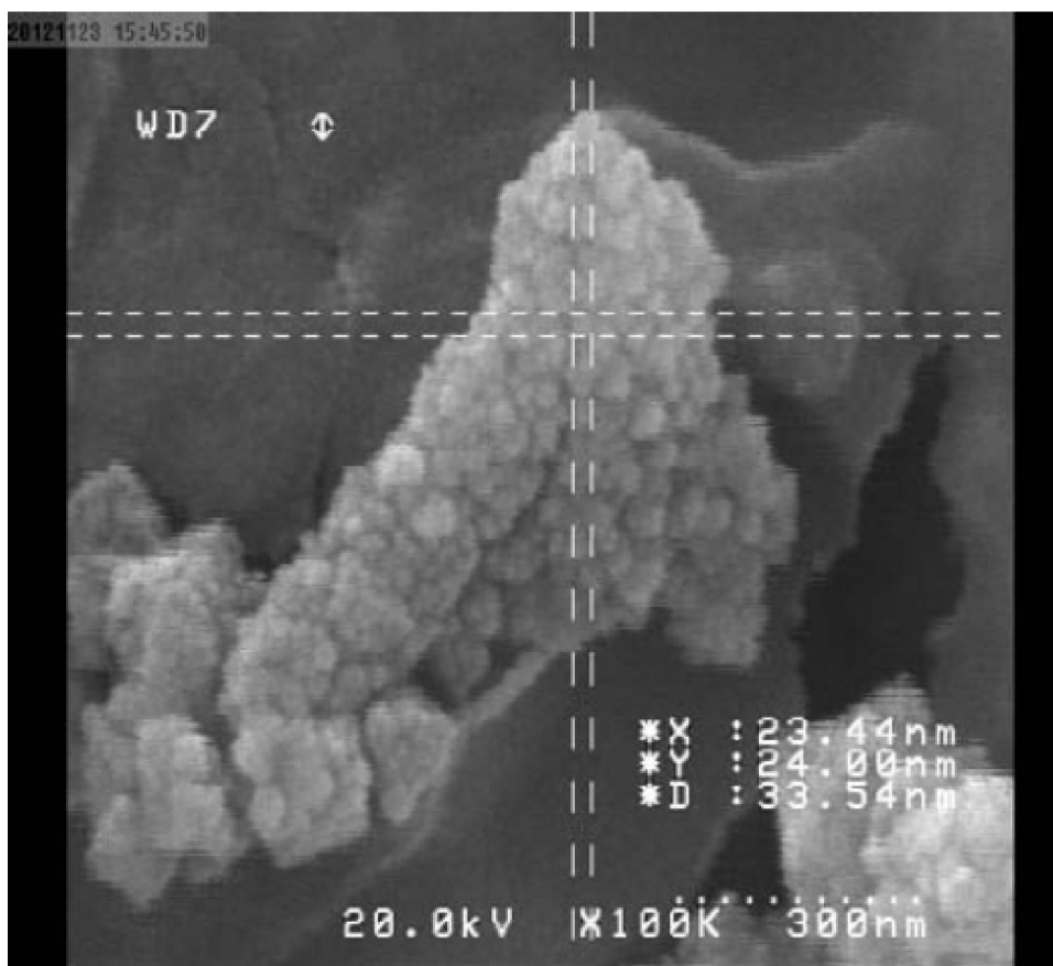
Figure 1b : SEM photo of produced zinc oxide nano particles